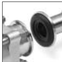
2. Place TS series gasket in groove on either ferrule.