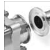
1. If using two TS series ferrules...