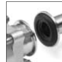
2. Place TS series gasket in groove on either ferrule.